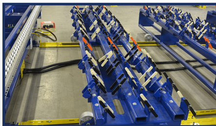
Color-Coded Joist Locators