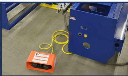
Footswitch & Push-Button Controls