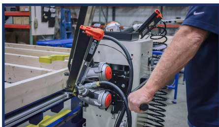
Indexing Tool Carriage