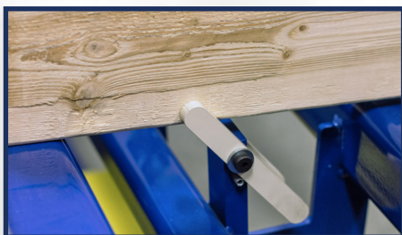
Color-Coded Stud Locators