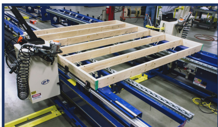
Framing Table with Indexing Tool Carriages

Framing Stations come equipped with indexing tool carriages and can also be purchased without. Indexing tool carriages eliminate the need to fasten wall panels by hand and allow operators to work at a safer ergonomic height.