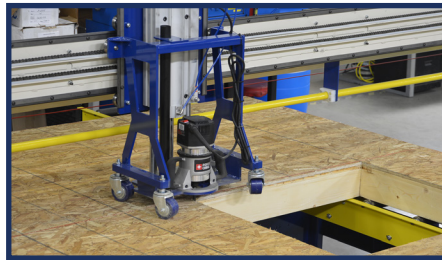
120v or 230v Router