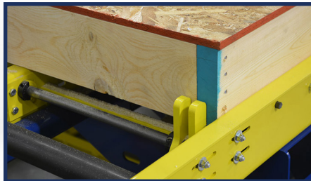
Wood Wall Panel Against Squaring Stops