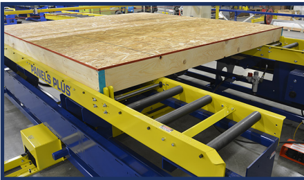
Squaring Table with Stationary & Telescoping Sides

The Panels Plus panelized wall panel systems are more ergonomic than traditional construction methods and are developed at an ergonomic working height. This eliminates the need to continually kneel or hunch over to build wall panels – improving employee health and safety.