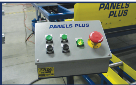
Moveable Work Pedestal