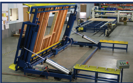
Fully Tilted Table

With single person operation, the Tilt Table pneumatically lifts the wall panel from lying flat to a 75-degree angle. It also provides the ability to easily access all sides of the wall panel, including the backside. This allows the operator to inspect the wall panel or to install horizontal blocking.