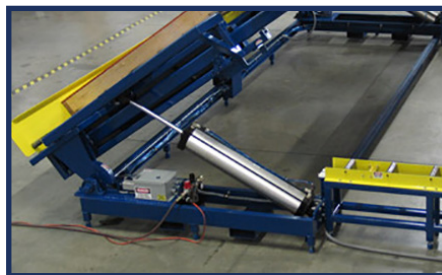
Pneumatic Lift Cylinders