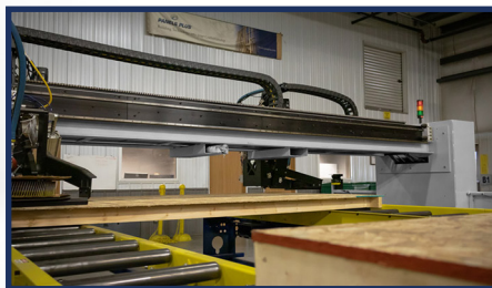
Automated Single Beam Bridge