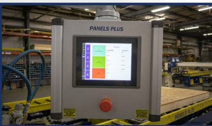
Touchscreen with Updated Interface & Software