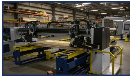
Automated Single Beam Bridge